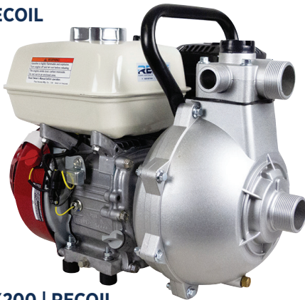
GX200 | RECOIL