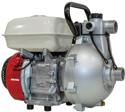
GP160 | RECOIL