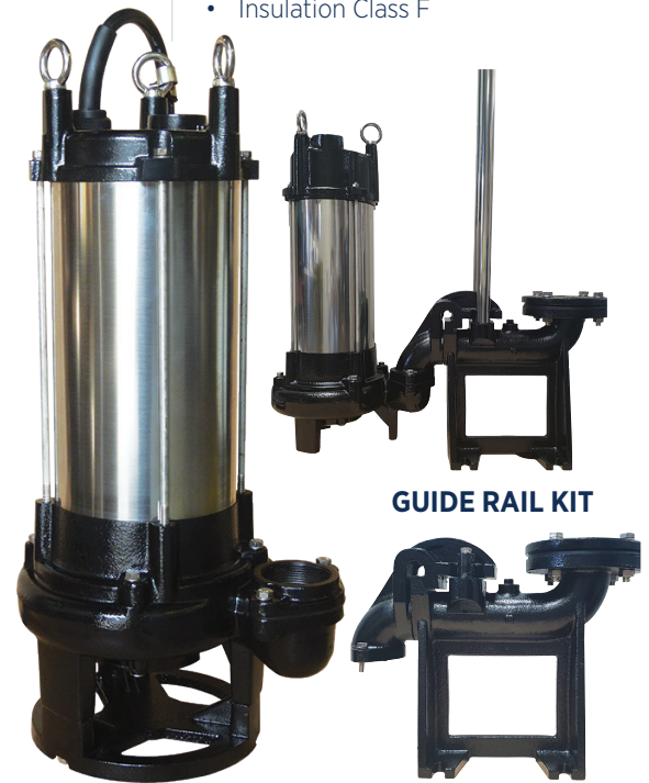
GUIDE RAIL KIT